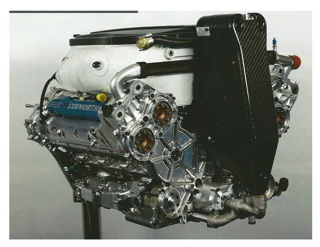
Race Engine Technology No. 073 Sept/Oct 2013 CA2013

In the new 2006 formula the CA powered the Williams FW28 but the relatively low-budget team were uncompetitive, finishing 8^{th} in the Constructors' Championship with only 11 points. The highest finishes were 2 x 6^{th} places.